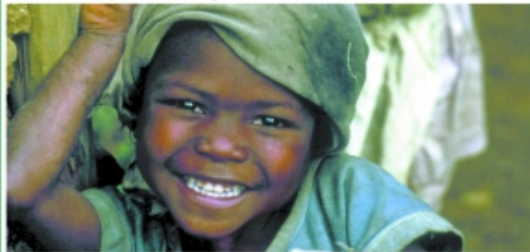
An irresistible smile belies the statistic that one in eight children is likely to die before their fifth birthday in Haiti, the highest child mortality rate in the Western Hemisphere, Unicef said in a report on 22 March 2006.

Note: This is easy to make in larger quantities to feed a crowd!